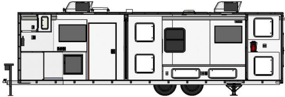
PASSENGER SIDE INTERIOR