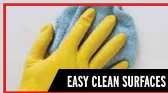
EASY CLEAN SURFACES