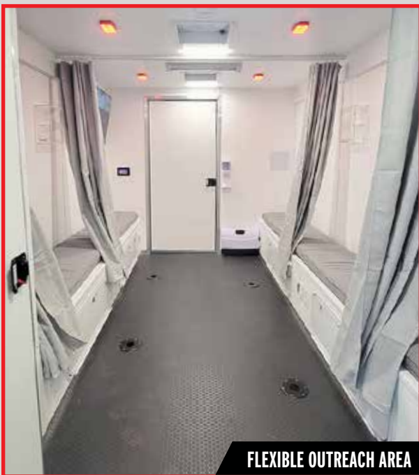
FLEXIBLE OUTREACH AREA

Heated seating, UV light disinfecting system, easy clean surfaces, modular workstations, bathroom (optional) and more!