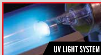
UV LIGHT SYSTEM